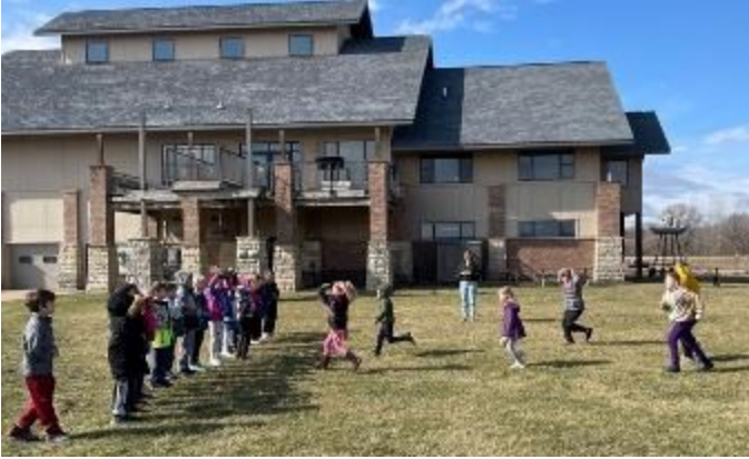
Maquoketa 1st-5th grade TAG students visited the Center in March as they began a unit about wildlife in Jackson County. By the end of the unit, students will be able to evaluate the impact of limiting factors on wildlife populations.