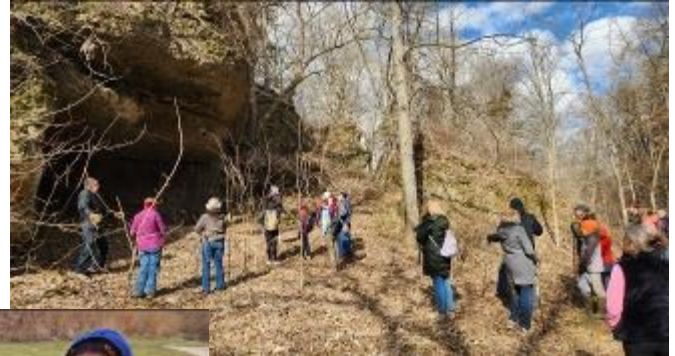
The OWLS group gathered at Whitewater Canyon in February. Instead of snowshoeing, we enjoyed a hike while learning about the archaeological and geological history of the park.

4th-6th graders enjoyed an overnight camp at the Center in December. We partner with the Extension office every year to provide a fun experience involving science and the outdoors. Normally we ice fish and snowshoe, but the unseasonably warm weather had us geocaching and doing other outdoor activities!