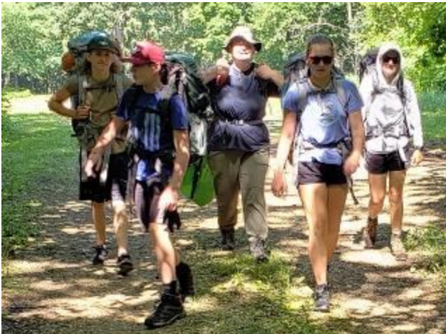
Youth backpacking and camping at Yellow River State Forest in June.

YMCA Summer Camp youth walked to Prairie Creek for some kayaking, swimming, and catching frogs with our Naturalists.