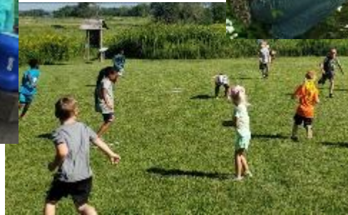
Kids playing a game while learning about predators and prey at Ranger camp.